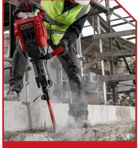
Heavy-duty drilling and concrete demolition are an easy task for the Full Boar range of rotary hammers & breakers.

You'll find the full range of Full Boar tools, and a whole new range of accessories to suit the task at hand, available at your local Bunnings. www